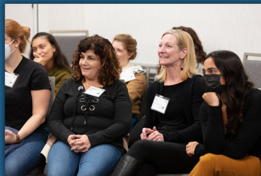
Pictured: ASC '22 attendees enjoying the first full day of sessions!